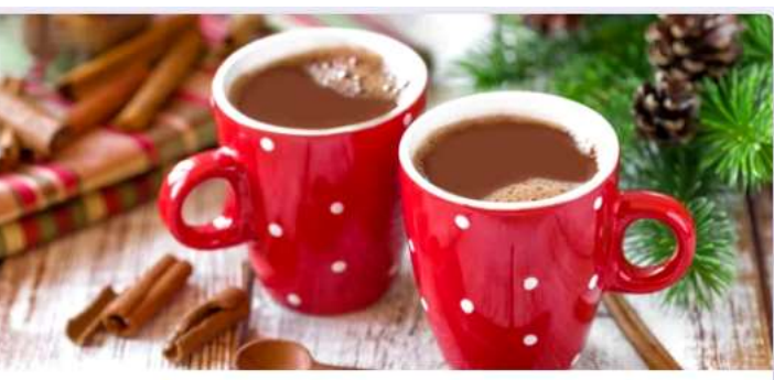
Sun Dec 13th, 2020 Hot Cocoa Day